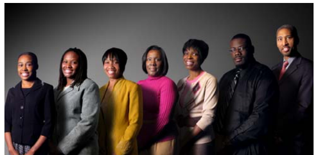
ISC Chronicle Staff

Greetings in the matchless name of Jesus Christ! By now I hope that you have experienced the effervescence of the constantly developing ISC Chronicle, our council news publication. The Chronicle is just one very significant facet of the Illinois State Council Department of Communications. It will be used in conjunction with our council website (iscapostolic.com) to showcase all of the components of the ISC. Please ask about our advertising rates. Our mission in the Communications department is to be the conduit that facilitates pertinent information and communication for the Illinois State Council and its constituency. Council members will be able to rely on the Communications department for the most accurate and up-to-date information as it relates to ISC services and programs. We are looking for spirit filled talented people to add value to our staff. Please see me if you have skills or know someone who has proficiency in writing, photography, IT, advertising, graphic arts, proofreading, circulation or production. Our goal is to accurately represent the ISC by tapping into the best it has to offer, for the up building of God's Kingdom.